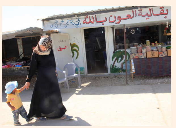
Main street in the Zaatari refugee camp in Jordan.

Long ago in a faraway place, a King ruled over his land. None of his subjects knew that he had huge ears--his ears were his deepest secret, which he